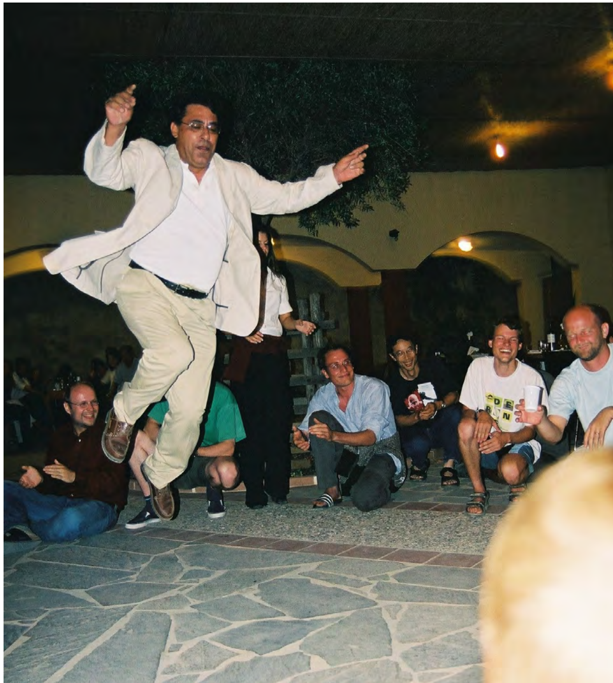
Kolymbari Network Meeting, September 2004